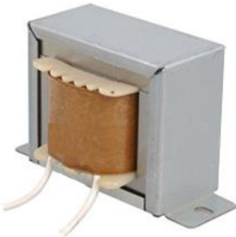
( Not to scale – For reference only )