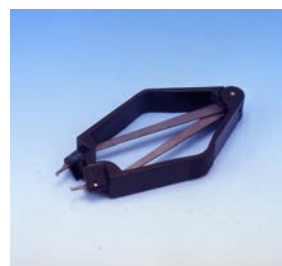
GX-8 PLCC EXTRACTOR