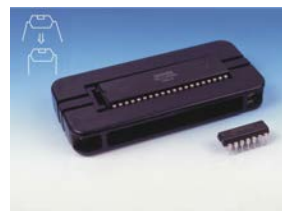
ICS-01 IC STRAIGHTENER