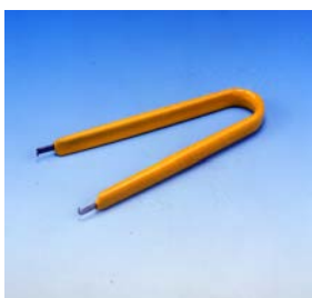
ICP-20 IC PULLER