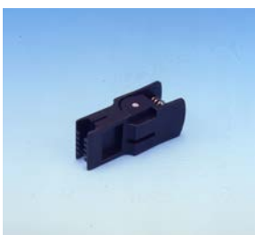
PB-16 DIP IC EXTRACTOR