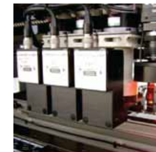
Laser optical aligners ensure precision component placement