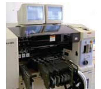
High speed automatic machines used on all major assembly lines