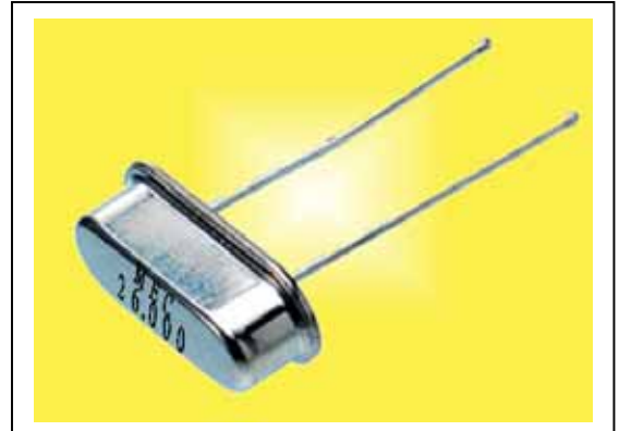
External Dimension (Unit: mm)