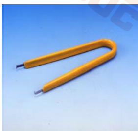
ICP-20 IC PULLER