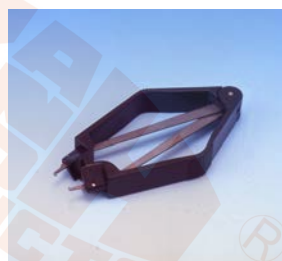
GX-8 PLCC EXTRACTOR